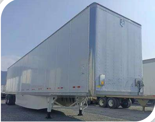
Dry box 53''

Length: 16.15 Width: 2.43 Height: 2.7 Volume: 110 m 3 Maximum weight: 22 ton Standard pallets: 24 at flat